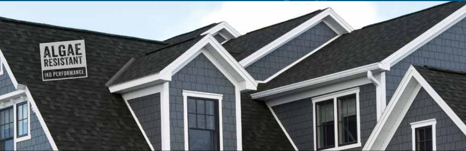
Color Featured: Dual Black

Architectural Shingles – Limited 30 Year Warranty 1